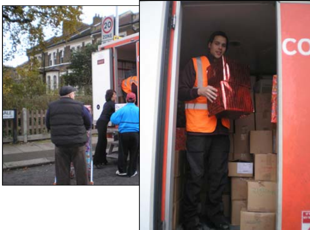
A bus man's holiday for the Sainsbury's staff!

They provided us with helpers and the Sainsbury's van to transport the goods from the Voluntary Care Centre Office on Monday 22nd November to Chapel on the Hill. Due to the fantastic help and support from Sainsbury's staff and VCC Volunteers the van was loaded and unloaded in super quick time, and before we knew it the project was set up and ready to go.