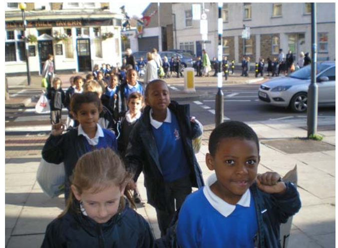
Children From St Dunstan's College delivering goods for the project

Over 50 people attended the Grove Centre Social Club Christmas disco (for people with mental health difficulties) and enjoyed pizzas and a special celebratory cake; specially made for the occasion.