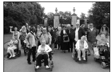
Drivers, Volunteers and Clients at Kew Gardens 2011

Just to remind you that if you haven't seen an old friend in a while then why not contact me to arrange it!